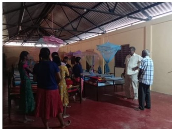
Visiting the children and the managers of Arobanam Girls' Hostel