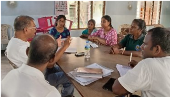
Review meeting with the teachers of St Joseph's Special Needs School.

St Joseph's, with a total student population of 52 children provides a curriculum that consists of two sections ... skills training and Montessori education for special needs children. It is encouraging to see that the children are able to make quality items through their training, and sell them to the general public