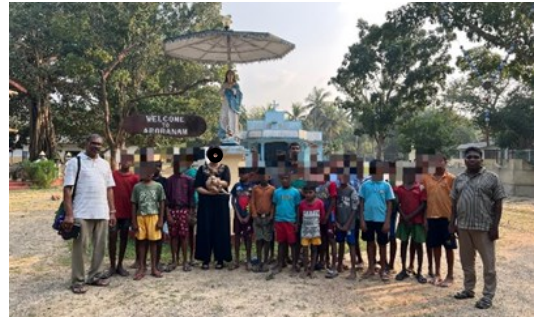
The Chairman visits Arobanam Boys Home and meets with the children and the Fr who runs the home