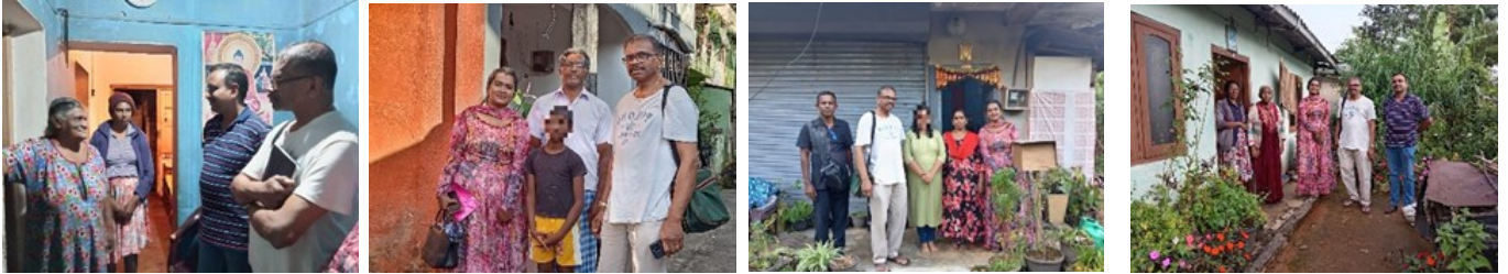
Meeting with head teacher of St Bosco College (Hatton) & interviews with potential foster care families

Assessing existing foster care, university & elderly care assistance