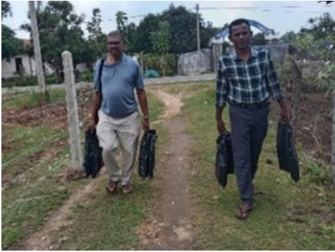
Distribution of school starter kits to foster care families

ACF assists, primarily in the very remote villages of Kadatkarachenai, and Senaiyoor in the Mutur area. Our support consists of foster care, university assistance, and tuition assistance.