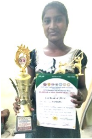
A child from Anaiyoor Camp wins a trophy & Certificate for her performance in a Yoga Competition