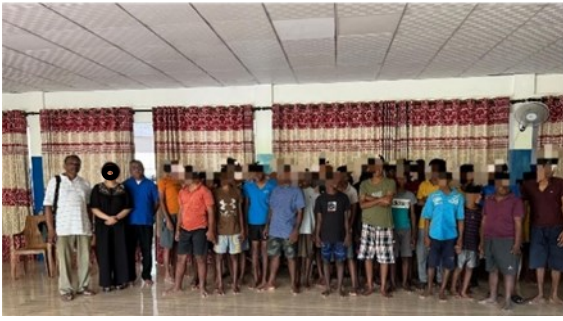
The chairman visits ASSETS – special needs residential home and meets with the children and the administrators