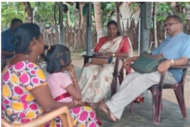
Families in Mutur are assessed for foster care assistance

She is now awaiting admission to Jaffna University