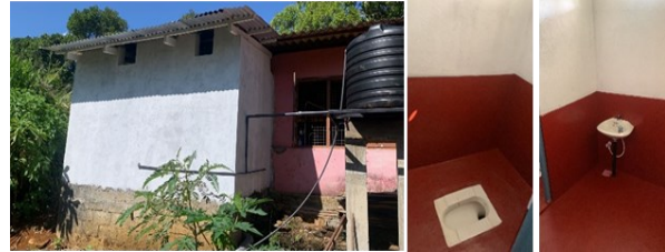
The Completed Toilet Building