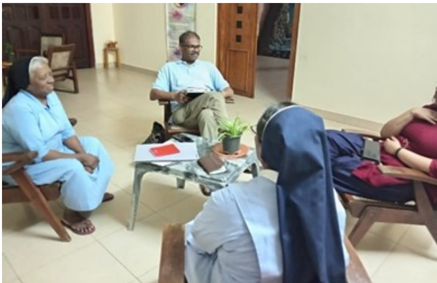
Meeting with the administrators of Welcome House.