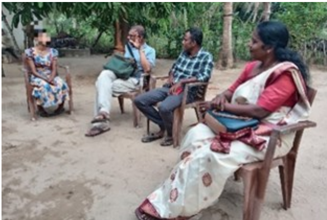
A former Foster Care child, who has been receiving online counselling through one of our overseas partners has greatly improved in health and spirit.

She is now awaiting admission to Jaffna University