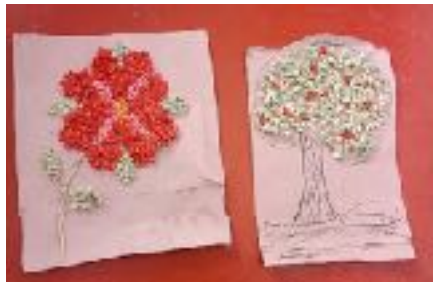
Beautiful pictures by our children at ASSETS