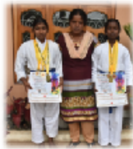
Our Children at national level Karate competition