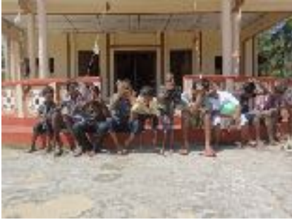
Our children at ASSETS

We are pleased to announce our involvement with a new endeavour targeted at empowering children with special needs. ACF are partnering with ASSETS (Association to Empower the Special Need Children), an organisation founded by a group of medical professionals operating in Kilinochchi who follow the doctrine that ‘disability is not inability’.