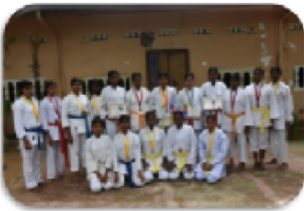
Our Children at national karate level competition

At present children entered University & studying degree courses while 2 of them are following management course at the University while they are doing Chartered Accountancy Course too. These are harvests of your support and assistance we suppose. 3 more children are selected for admission this year also.