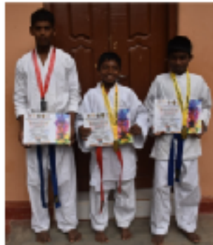
Our Children at national level competition