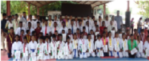
Our Children at district level karate competition

Further our children participated divisional, district and national levels sports and they secured various medals. Please see the photos & news items which will speak to their performance.