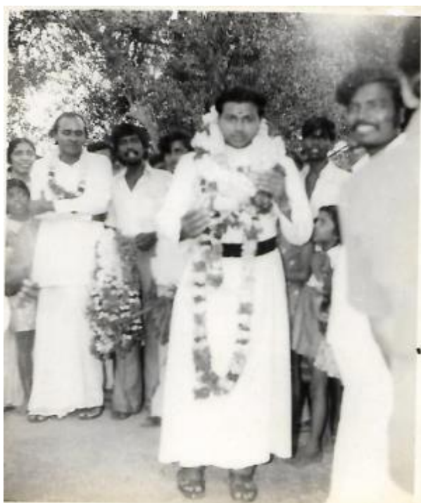
Farewell at Cheddikulam